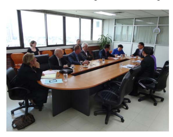
Meeting at the Ministry of Natural Resources and Environment in Thailand

The delegation met with Mr Wijarn Simachaya, deputy Permanent Secretary of the Ministry of Natural Resources and Environment of Thailand. He confirmed a target of reducing greenhouse gas emissions (GHG) by between 7 % and 20 % based on securing external funding.