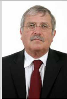
M. Pierre-Yves COLLOMBAT Président délégué pour l'Éthiopie Sénateur du Var (RDSE)