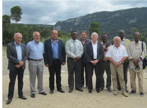
Ethiopian delegation visiting innovative water treatment in Ampus (Var) with M. Pierre-Yves Collombat and the mayor of the village