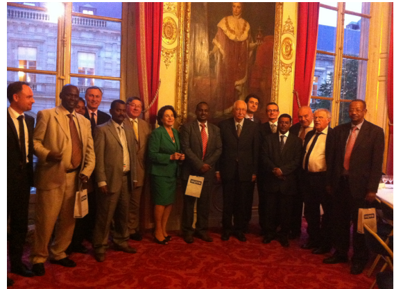
Ethiopian delegation and senators of the friendship group France-Ethiopia after the interparliamentary dinner offered by the French Senate

The delegation was warmly welcomed by senators upon arrivals and held various productive discussions with senators, deputies, officials from ministry of foreign affairs, big business enterprises, regional and municipal officials.