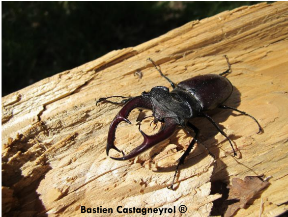
Bastien Castagneyrol ©