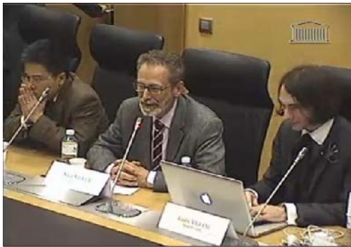
From left to right : MM. Ngô Bảo Châu, Yves Meyer et Cédric Villani

The general conclusions of the public hearing of 14 October 2010 were presented at the Office meeting of 17 November 2010. The Office was proud to welcome, on the same day, the French winners of the Fields medal, Messrs. Ngô Bảo Châu and Cédric Villani, as well as the winner of the Gauss prize, Mr Yves Meyer. These people mentioned in particular the place and role of mathematics in finance.