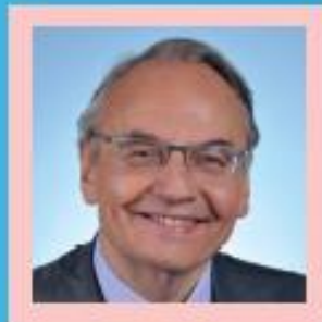
Mr Jean-Louis BOURLANGES Member of National Assembly for the Hauts-de-Seine department, vice-president of the European Affairs Committee of the French National Assembly