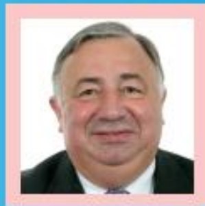
Mr Gérard LARCHER President of the French Senate