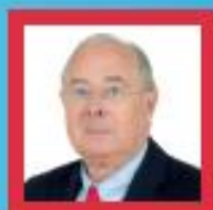
Mr Jean BIZET Senator of Manche, President of the European Affairs Committee of the French Senate