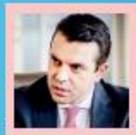
Mr Nikola POPOSKI Former Minister of Foreign Affairs and Deputy Prime Minister of the Republic of North Macedonia, President of the National Council for European Integration of the Republic of North Macedonia