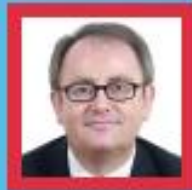
Mr Jean-Yves LECONTE Senator representing French people living outside France, member of the European Affairs Committee of the French Senate