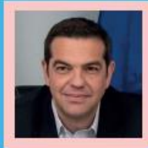
Mr Alexis TSIPRAS Former Prime Minister of Greece and leader of the Opposition