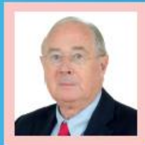
Mr Jean BIZET President of the European Affairs Committee of the French Senate