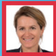
Ms Anne-Catherine LOISIER Senator of Côte-d'Or, member of the European Affairs Committee of the French Senate