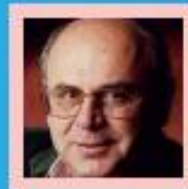
Mr Alexandre HERLEA Professor Emeritus, former Minister for European Integration of Romania, former Romanian Ambassador to European Union, President of the Association La Maison roumaine