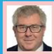
Mr Ryszard CZARNECKI Member of the European Parliament